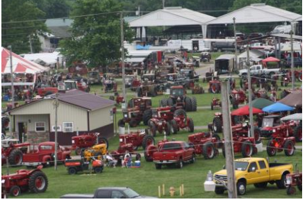
Sea of Red!!

To view more pictures from the RPRU visit our Facebook page, International Harvester Collectors Missouri Chapter 1.