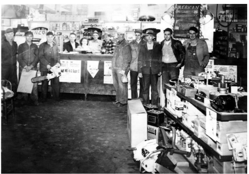
This picture is from the early 1950s.