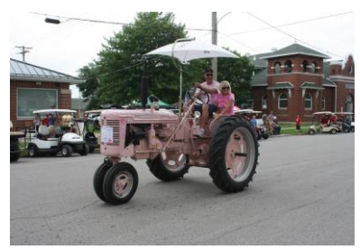
In Memory of MOM